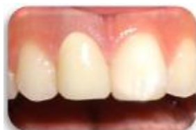
Fig-3: Provisional prosthesis