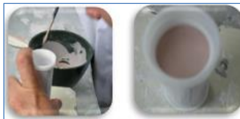
Fig-8.a, b: investment