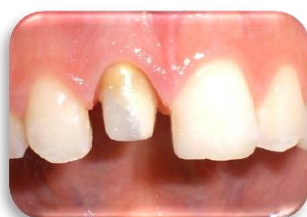
Fig-2 : Reconstitution of the stump and peripheral preparation