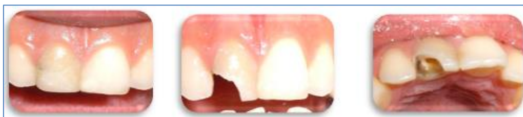
Fig-1.A: initial case, b: removal of the composite resin, c: cleaning of the intracoronary cavity

At the same time, the tooth is cleaned, rinsed, dried and then isolated from moisture. It is coated with a self-etching, self-curing adhesive. Multilink Automix® composite glue is applied directly into the crown with the automix syringe. Once the crown is in place, light-curing is carried out (40 seconds per side). We finish by eliminating the excess (fig. 16).