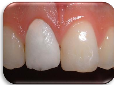
Fig-13.a, b: Try-in of the coping on the model then in the mouth and reassessment of the color