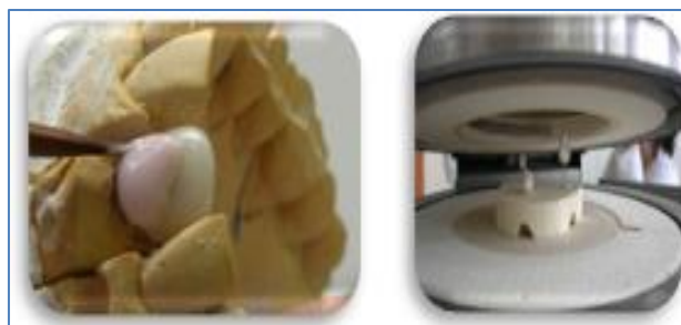
Fig-15.a, b: layering of the ceramic