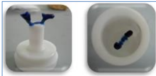
Fig-7.a: Fixing the model on the casting rod, b: placing in cylinder