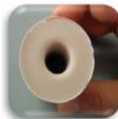
Fig-9: Unmolding the cylinder