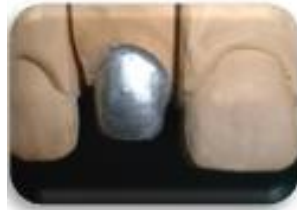
Fig-5: Plaster model + spacer varnish