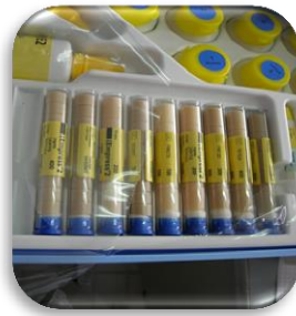
Fig-11: Ceramic ingots