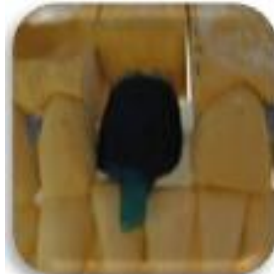
Fig-6: Wax model