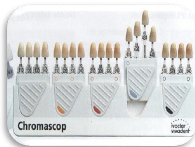
Fig-14: choice of shade