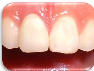
Fig-16: final result after bonding