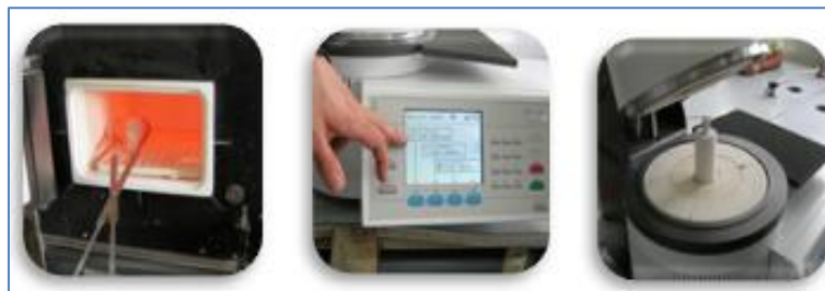
Fig-10.a, b, c: injection under pressure of the glass ceramic in a special oven