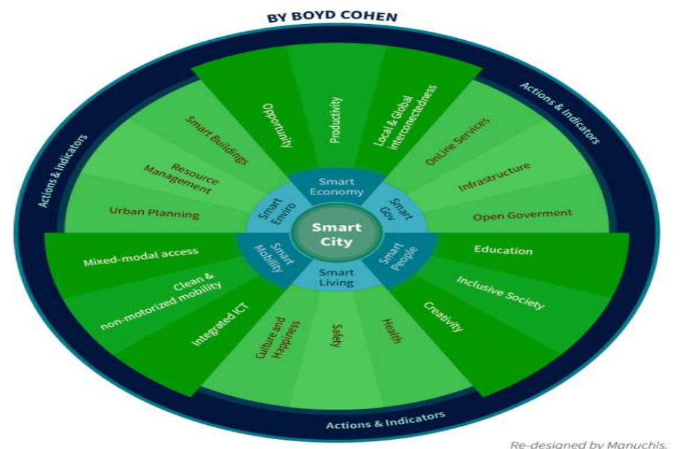
(Extracted from Central Policy Unit, 2015)