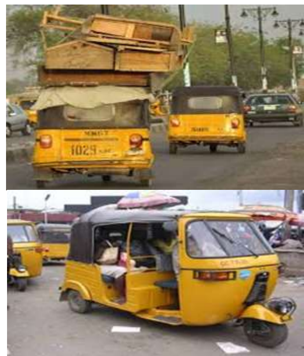
Figure 4.1: Overloaded tricycle

Some of the tricycles engages in overloading in terms of passengers and luggage's in order to make extra gains, such as carrying an extra passenger at the driver side after carrying the specified 3 passengers at the back seat, thereby affecting the effective handling of the tricycle, some are even fond of placing luggage's on the roof of the tricycle respectively, all these activities affect the proper operation of the tricycle as there is specified maximum carrying capacity of the tricycle, so in the event of any unforeseen circumstances it makes it difficult for the driver to manoeuvre the tricycle resulting in disaster, so the tricycle drivers should desist from overloading to avoid accident.