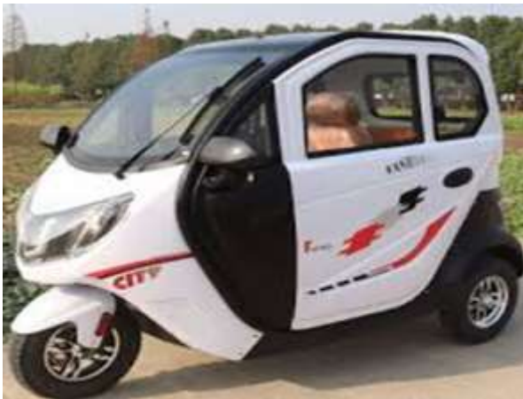
FIGURE 4.2: TRICYCLE WITH DOOR

and doors will help safe guide the tricycle occupant in time of accident thereby minimizing casualty.