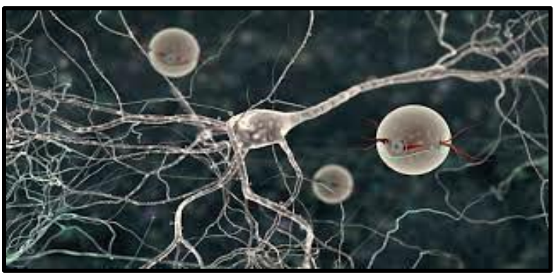
Fig-1: Nano Technique in Medical Identification of Cancer