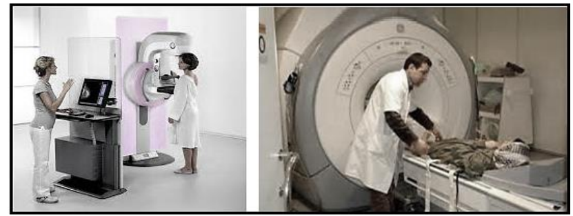
Fig-3: Early automated diagnosis of tumors